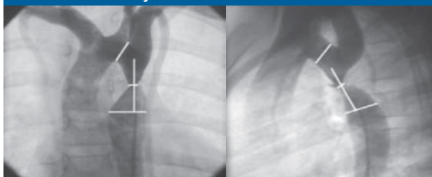
Figure.1 Lateral and antero-posterior angiogram of native coarctation with key measurements shown

After measurements had been taken the appropriate size stents and delivery balloons were chosen. The initial balloon size was selected on the basis of the smallest diameter proximal to the coarctation segment; Covered CP stent was hand crimped on a balloon dilation catheter (either Z-med balloon dilatation catheter or BIB balloon according to availability in the stock) and advanced within the sheath (12-14 F) to the coarctation site over the amplatz super stiff wire anchored in the right or left subclavian artery according to the angle of the coarctation. The stent then inflated (hand inflated 50 cc syringe) after securing its position with contrast injection with or without the assistance of rapid ventricular pacing. The technique was considered effective if the invasive grade was decrease to <20 mmHg and increased the angiographic diameter >50%. After the procedure, the patient discharged on aspirin 300 mg daily for six months, and given antihypertensive drug treatment when necessary. Repeated echocardiographic examinations performed 24 hours after the procedure to evaluate stent localization and the presence of residual gradients. Follow up ranged from 6-32 months (mean 14.9 Months) included clinical, echocardiographic and CT exam assessing for restenosis, aneurysm formation, stent migration, blood pressure control and the intensity of antihypertensive medications.